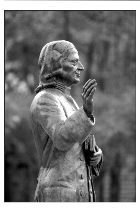
A first-rate faculty and personal attention are Virginia Wesleyan College trademarks that have earned the liberal arts institution a national reputation for excellence.